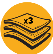
3 PLY HEAD DESIGN