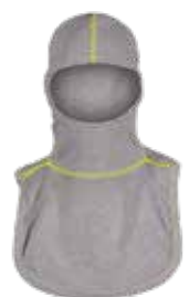
PX2 VSSY GY