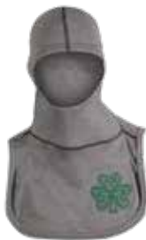
PX2 FI CELTIC GY