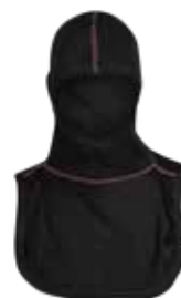
PX2 VSP BLK