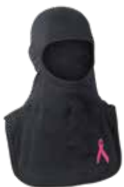
PX2 FI PINK RIBBON BLK