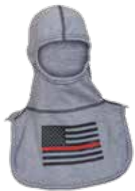
PX2 FI FLAG-RL GY