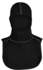
PX2 VSKG BLK