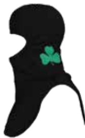
PX2 FI SHAMROCK BLK