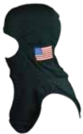
PX2 EMB FLAG BLK