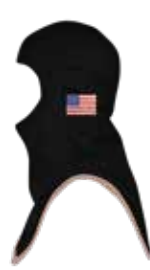
PX2 EMB FLAG PG BLK