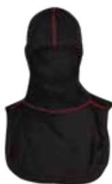
PX2 VSRED BLK