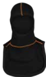
PX2 VSO BLK