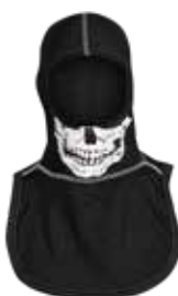
PX2 FI SKULL BLK