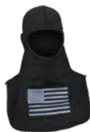
PX2 FI GREY FLAG BLK