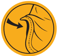
NOTCHED SHOULDER BIB