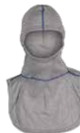
PX2 VSROYAL GY