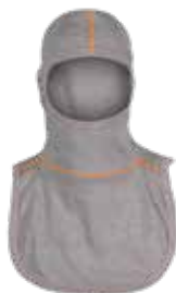
PX2 VSO GY