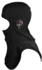
PX2 FI PUNISH-RL BLK