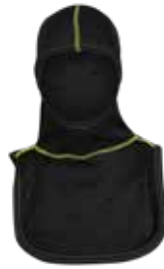
PX2 VSSY BLK