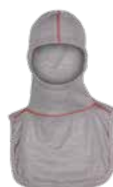
PX2 VSRED GY