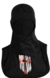
PX2 FI FLAG PIKEAXE BLK