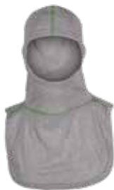
PX2 VSKG GY