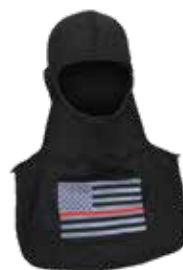
PX2 FI FLAG-RL BLK