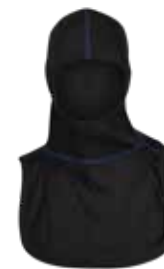
PX2 VSROYAL BLK